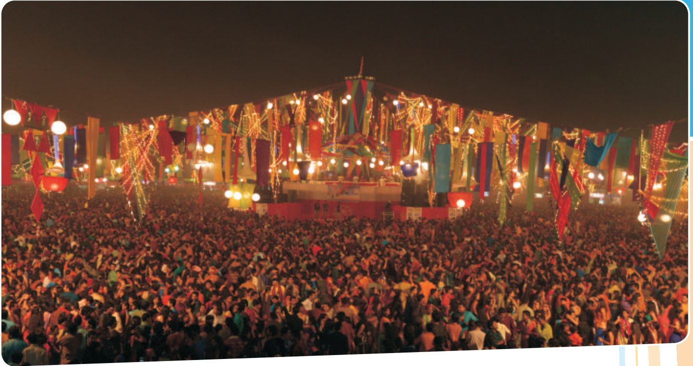
With more than 1 Lac people attending the Annual Fund Raising Event, Barodians joined hands with United Way to help support the community.