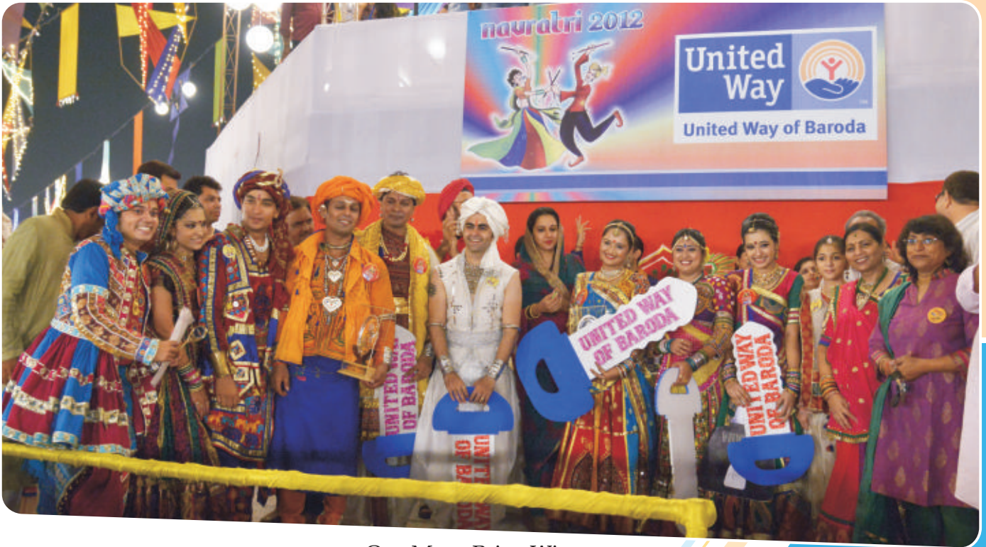
Our Mega Prize Winners